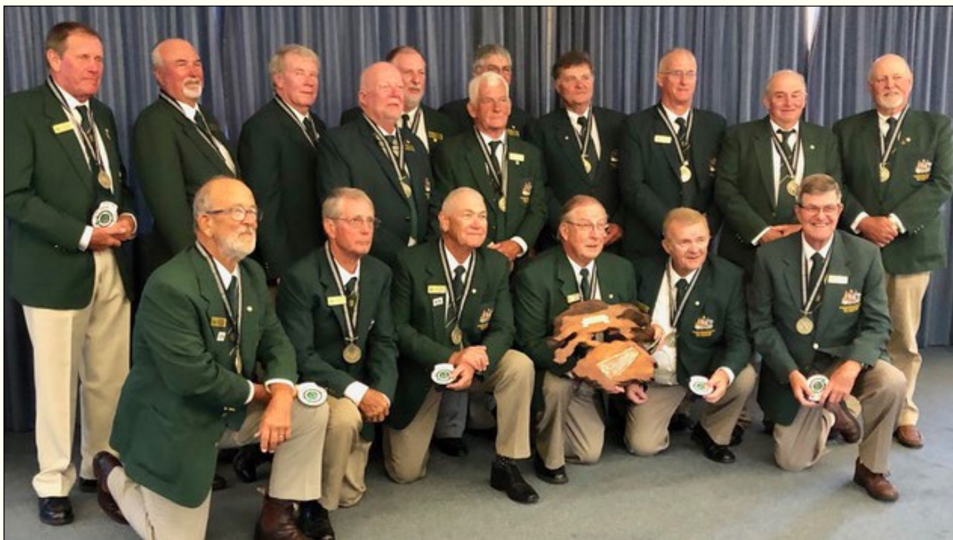
WLRC with trophy

Australia's first competition, the Tony Loughlan Memorial turned out to be of huge benefit for the major match in that as the day progressed, the notorious Trentham winds became evident.