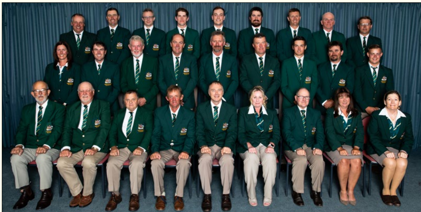
Australian Palma Team