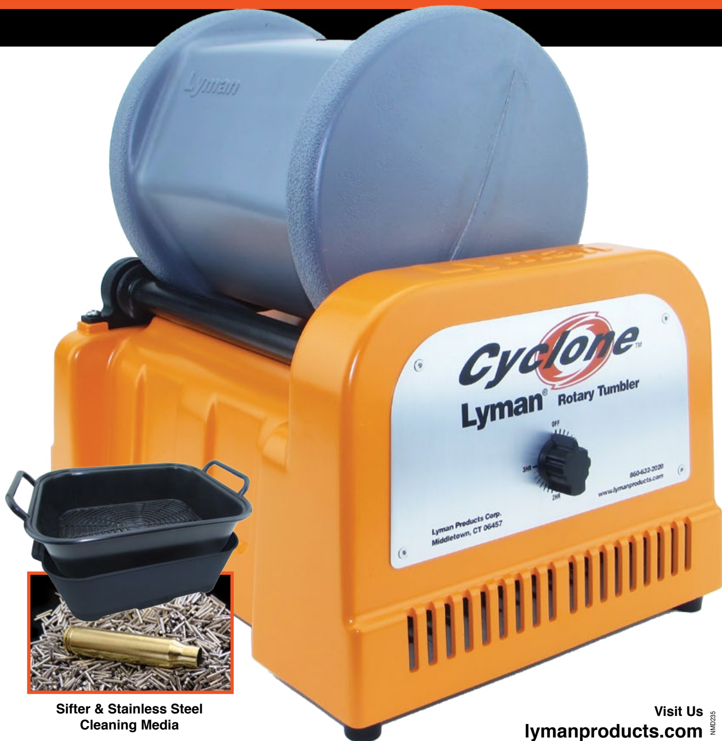
Sifter & Stainless Steel Cleaning Media