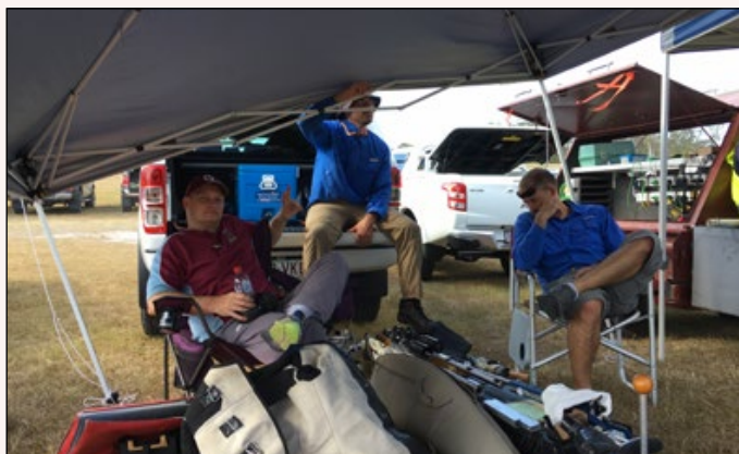
Chewing the fat