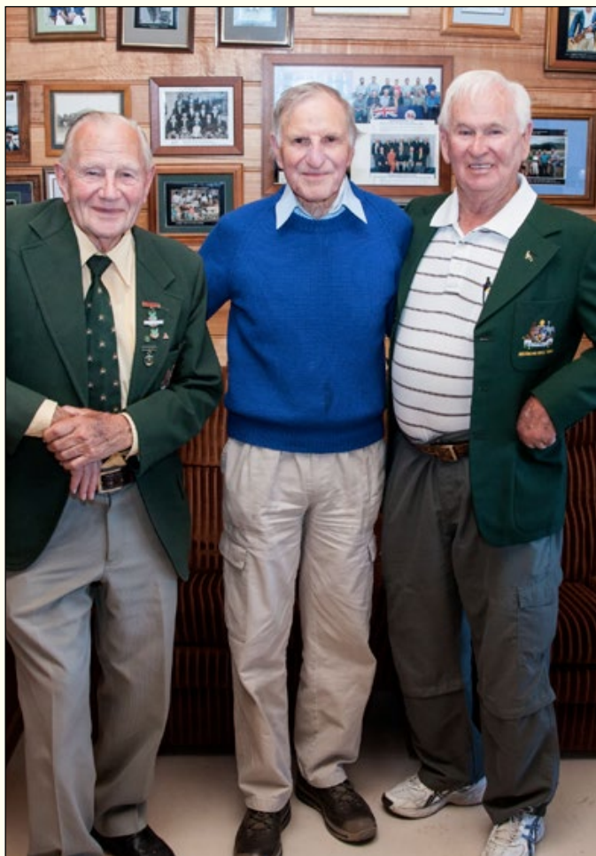
Three Tassie champions

The first day of the Queen's Badge competition on Saturday, March 9 saw fine and mild weather, but with developing light and highly variable winds.