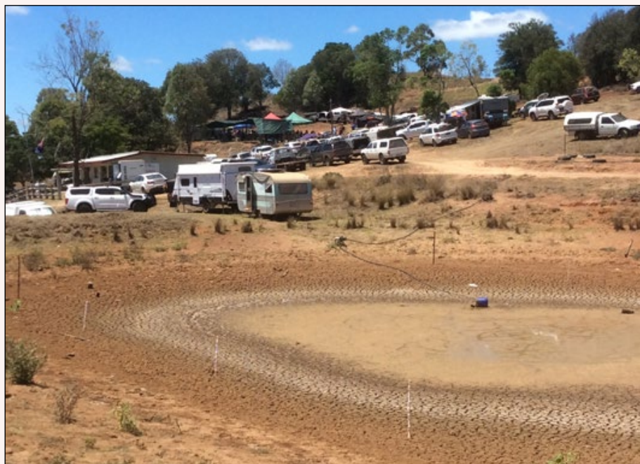
On the slope at 600 yards

FS B was won by Peter Birch of North Arm on 169.10 ahead