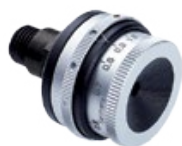
566-S rearsight iris, 6-colour filter