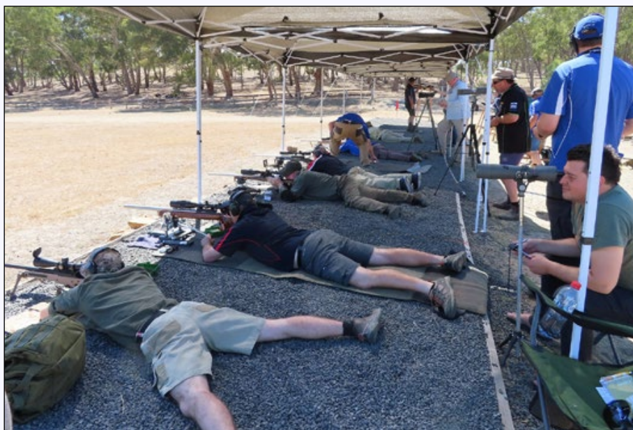
Shooters on the mound