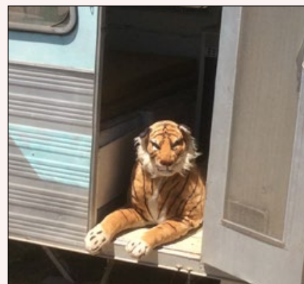
You're not coming in here!!!!