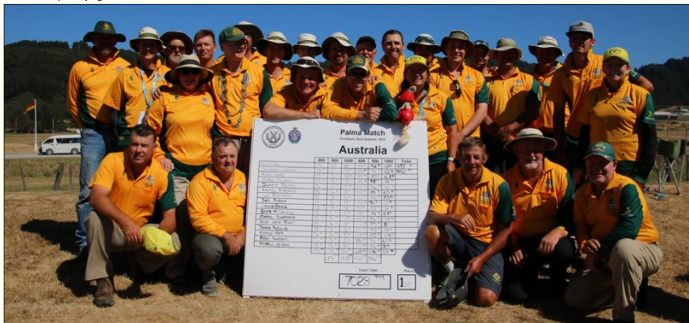
Australian Palma team scoresheet