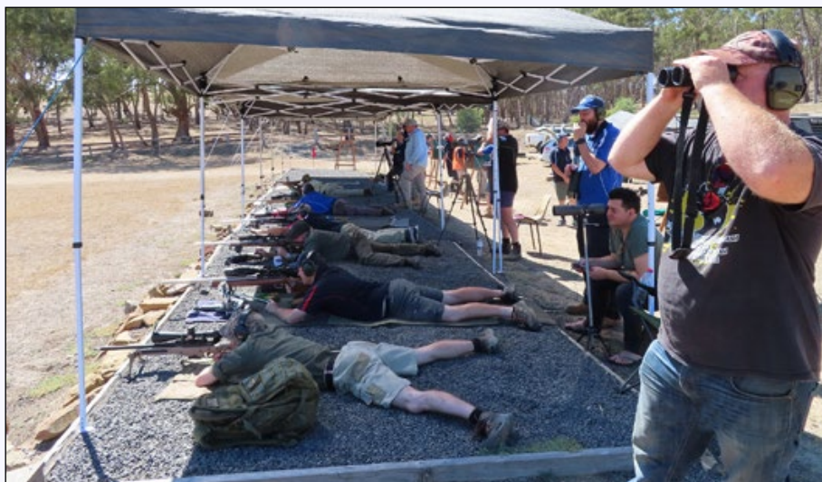
Thanks to South Bendigo for their shade tents which were well received and appreciated by all

For any information on future events you can call the captain on 03 5474 2552.