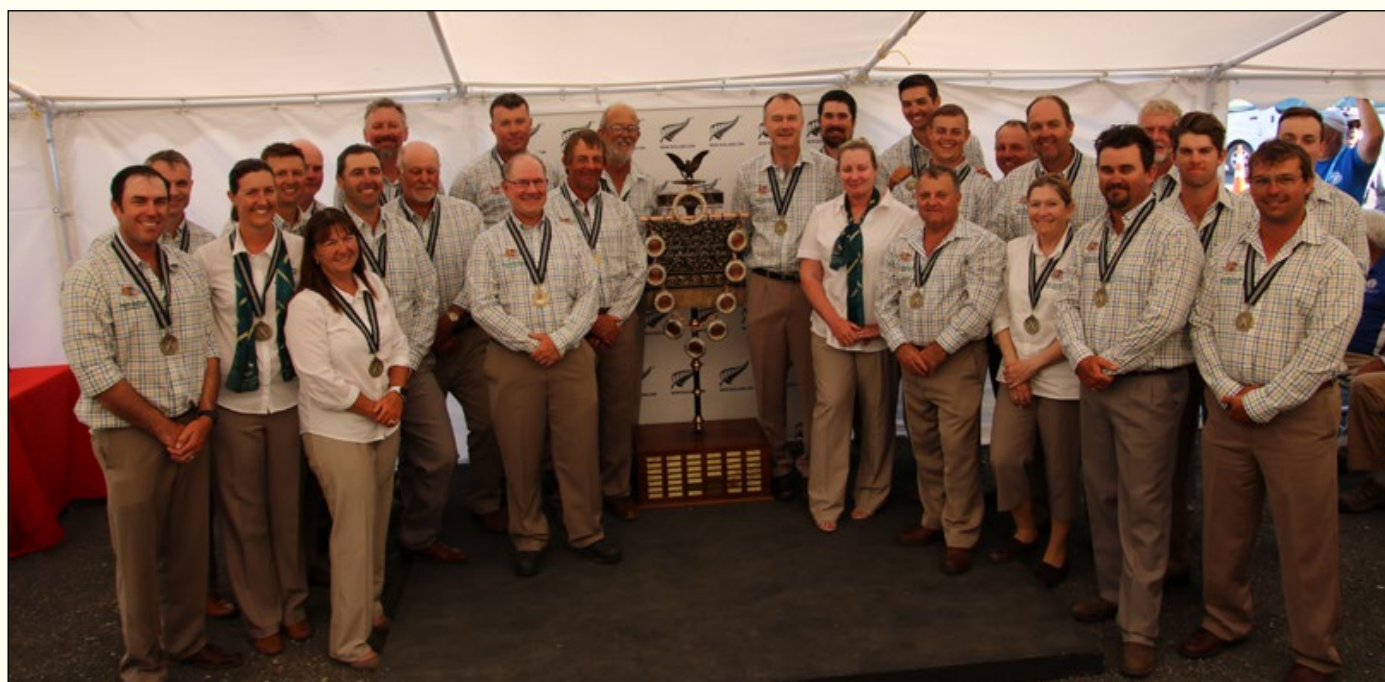
Happy faces all round for the Australian Palma team

down and have an easy waltz to victory, but it did the opposite.