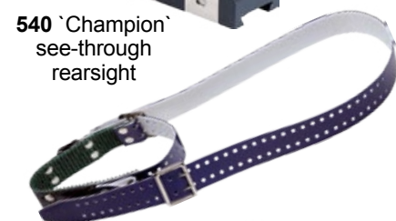
437 'pulse-free' sling