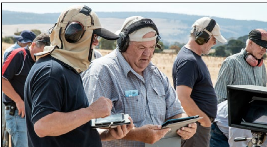
Checking the scores