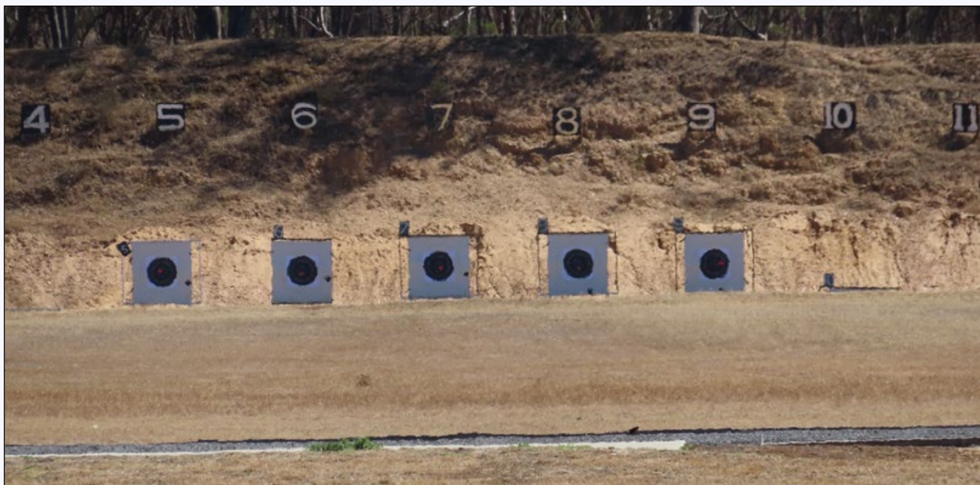
The targets from the firing mound