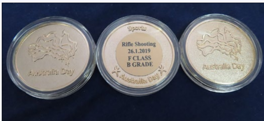
Some of the Australia Day Medallions