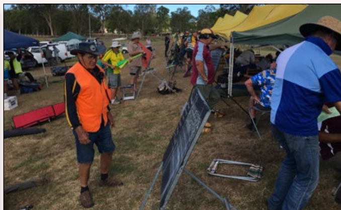
Con the RO