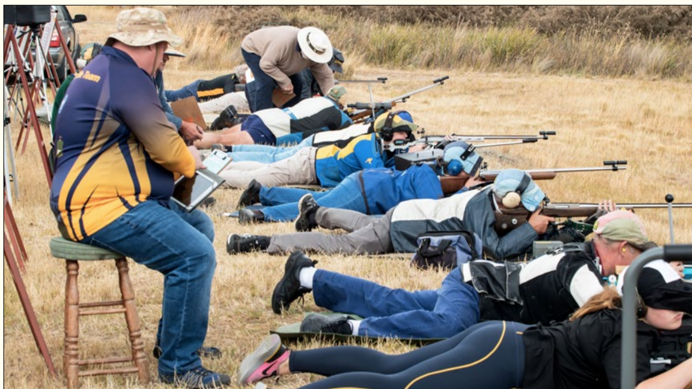
On the mound