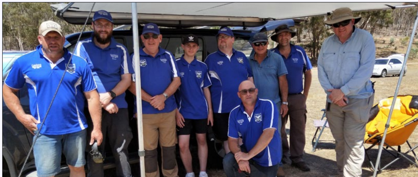
Geelong Rifle Club was well represented and very successful