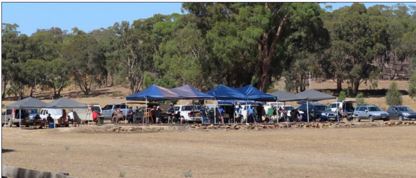
Shooters preparing for the day's event