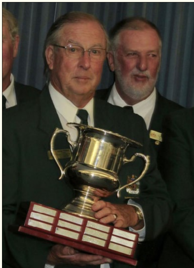
Trans Tasman Trophy