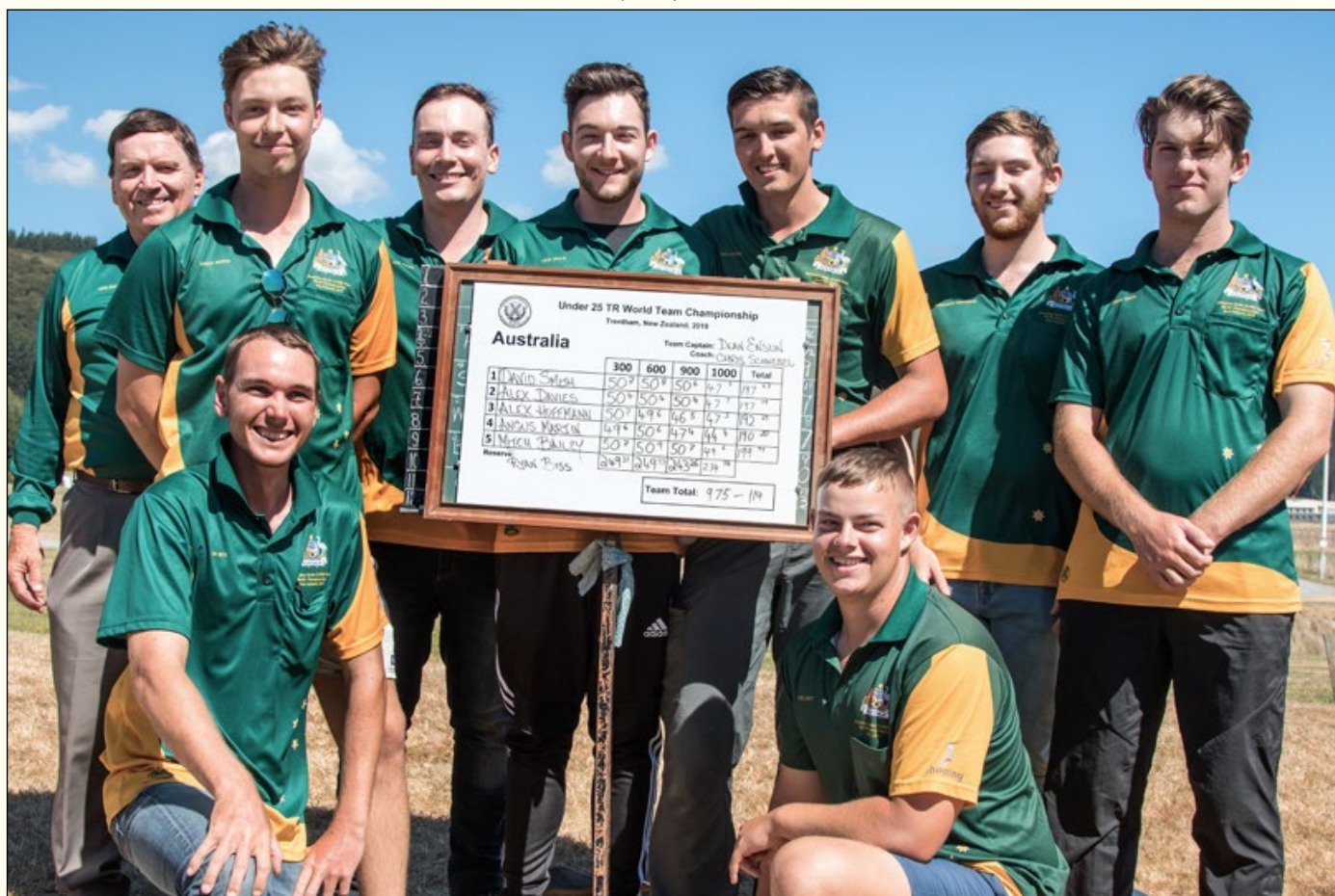
Australian Under 25 Rifle Team