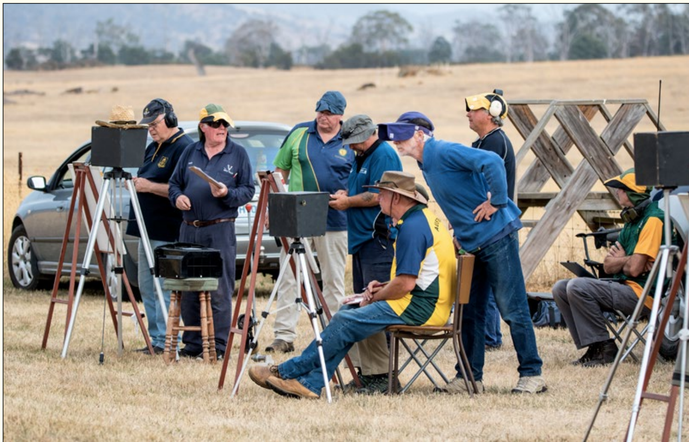
Checking the scores