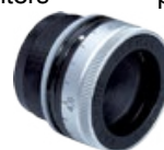
522-S iris foresight