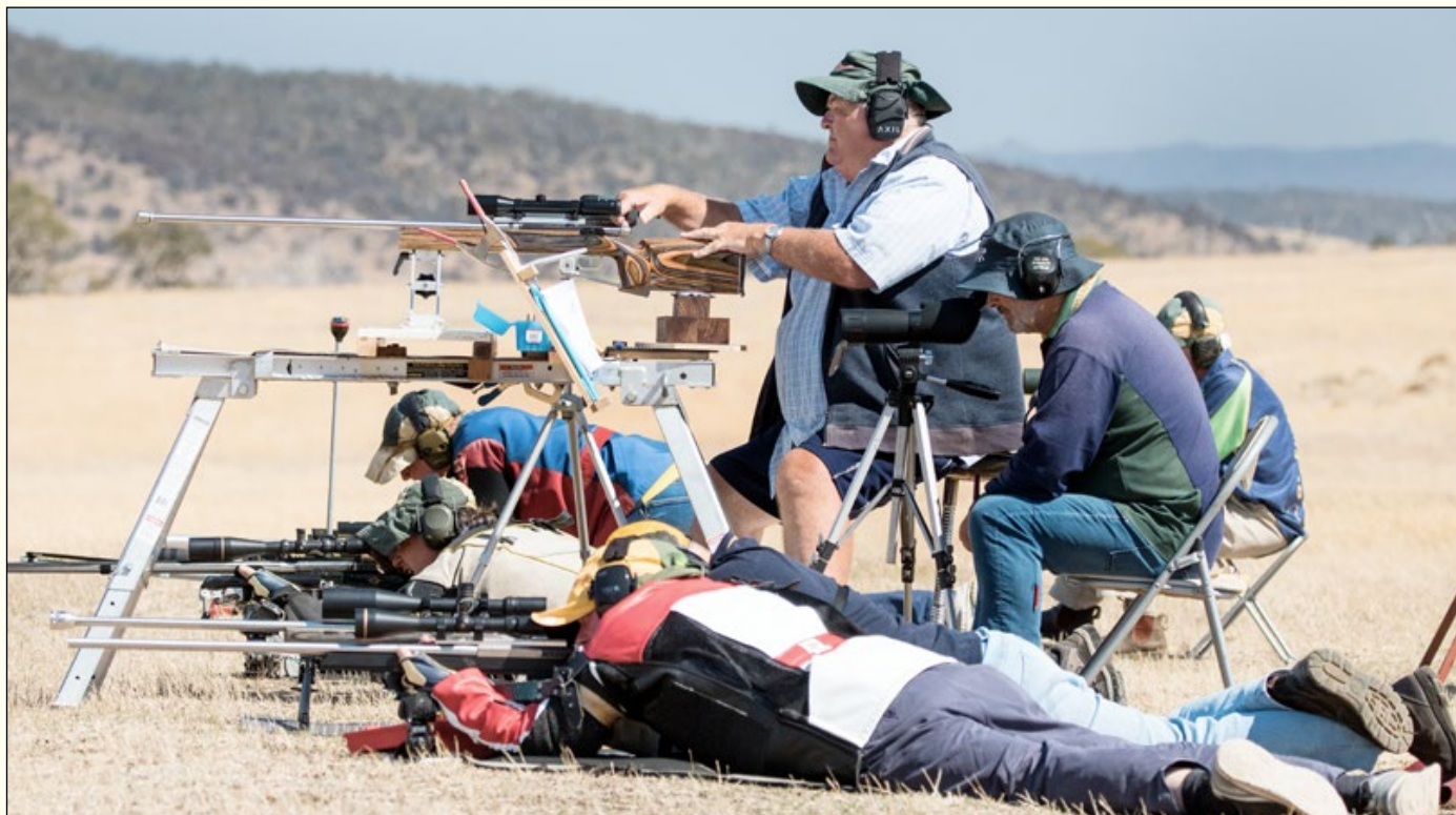
On the mound