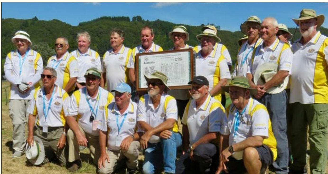
WLRC On Range

The World Championship Match was approached with quiet determination and optimism. We knew we had the shooting and coaching ability to handle the conditions, and that proved to be the case.