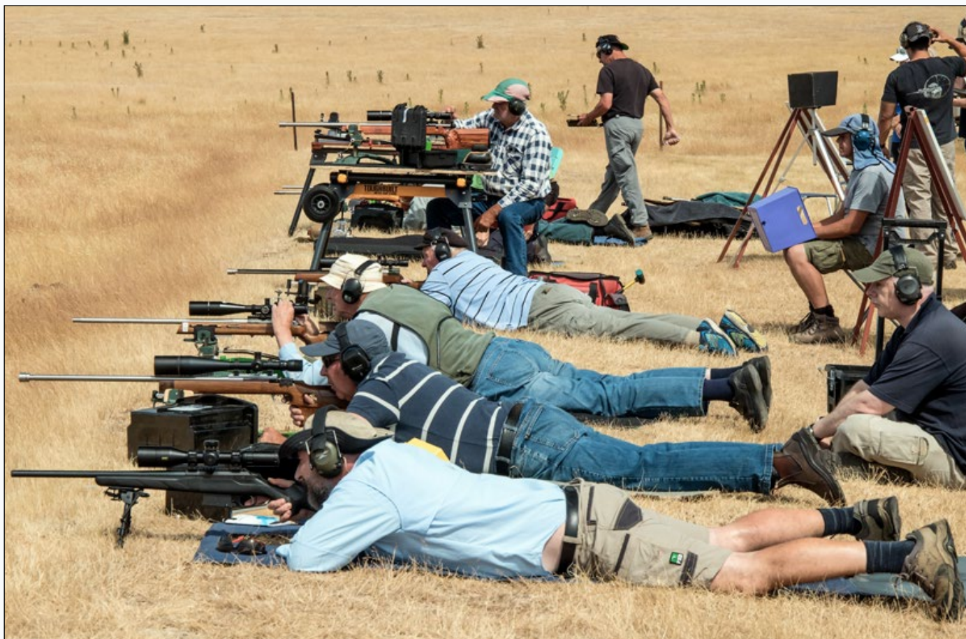
On the mound