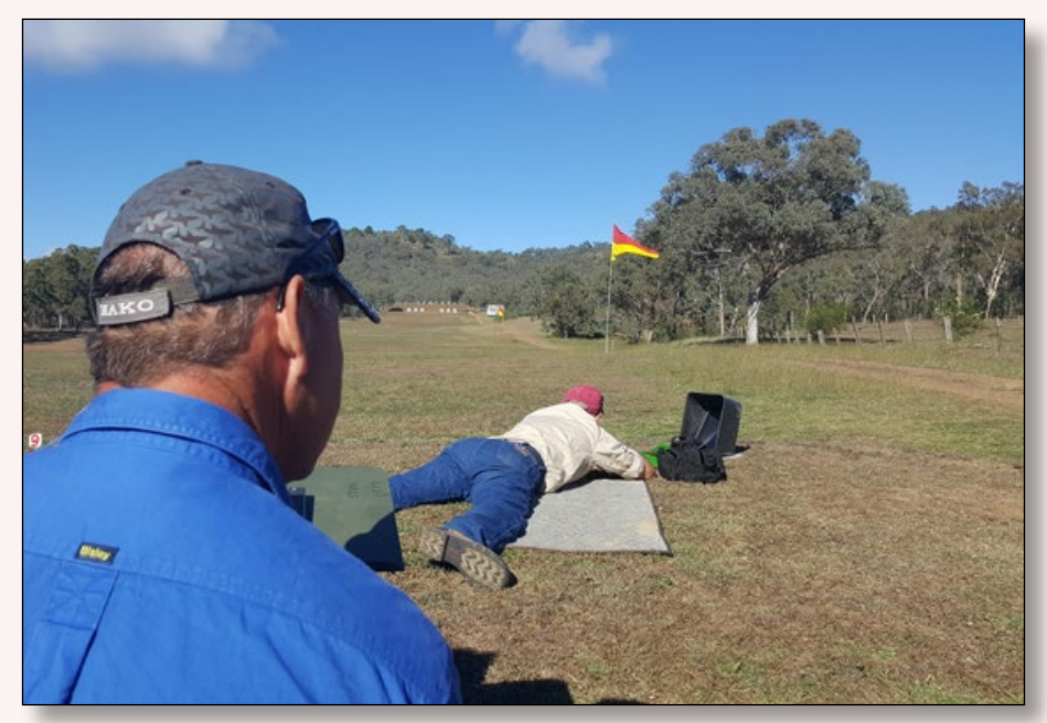
Sunny conditions on the range

This writer had always promised himself that he'd be at the next Open Prize Meet (OPM) to be held at Warwick, if not before.