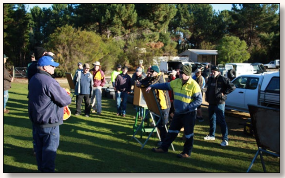
A cold start to a sunny day