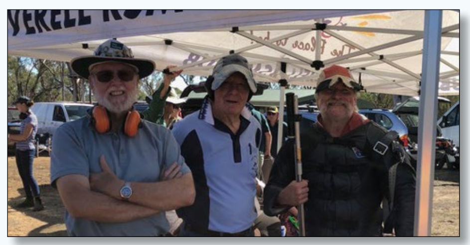
Wise men prepare for 600 yards on day one