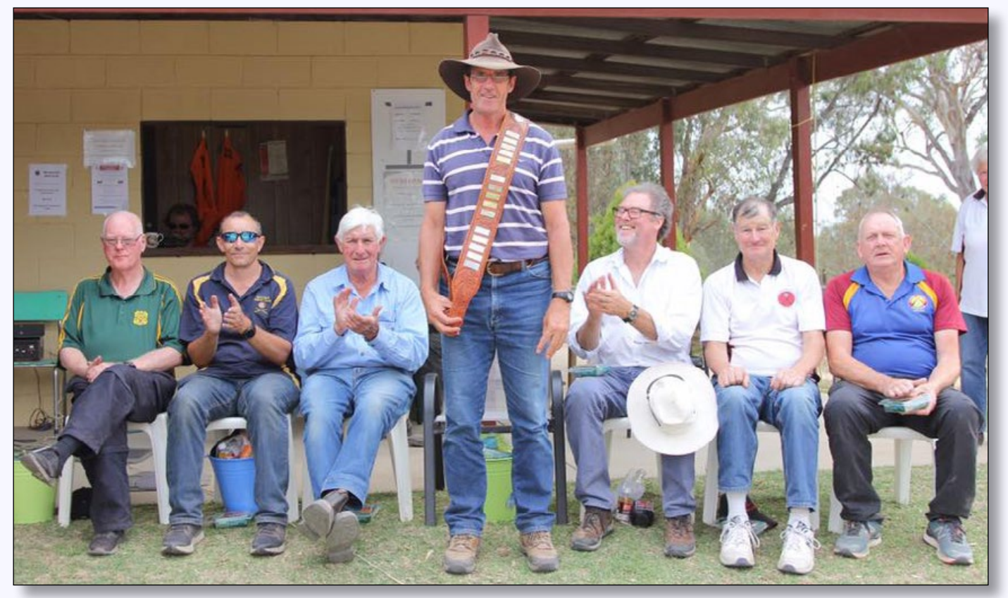
Winners WRC OPM