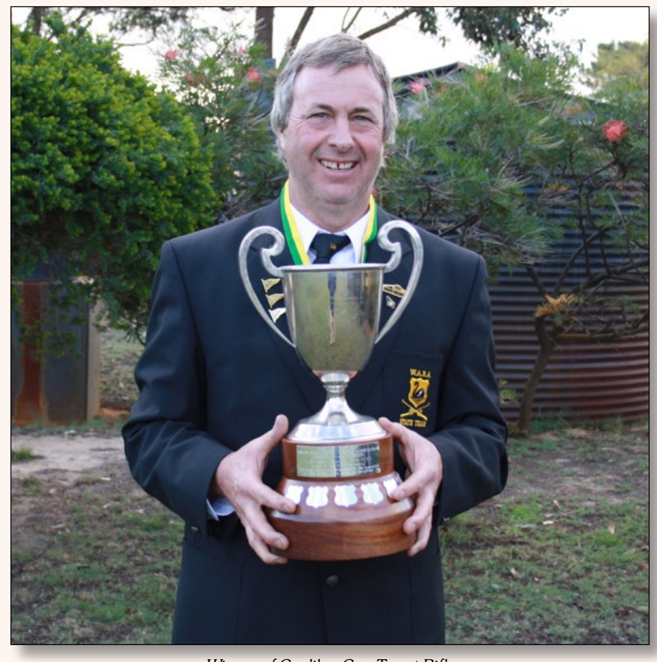
Winner of Coolilup Cup Target Rifle

Friday and Saturday scores covered all ranges from 300 to 600 metres, and marksmen competing in both the Service Rifle and Sporting/