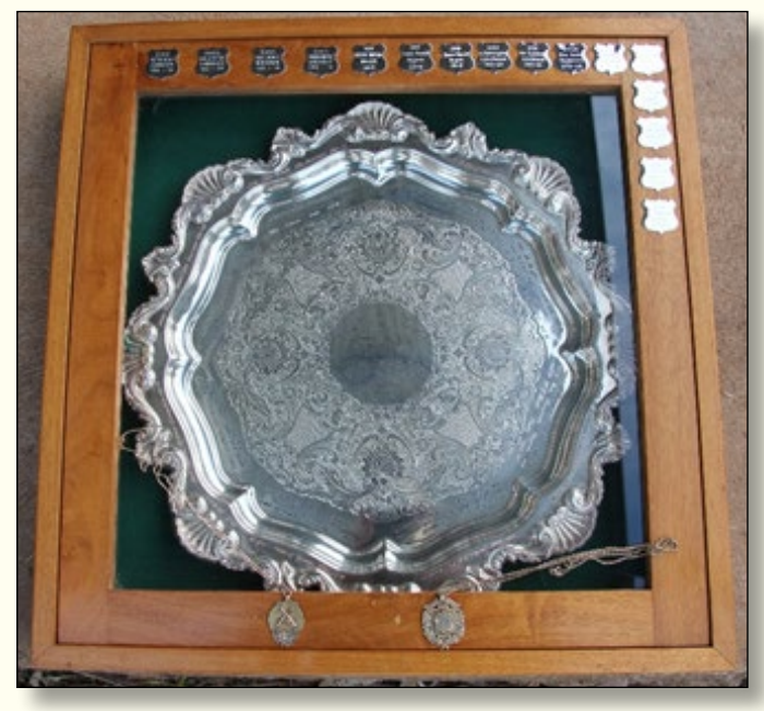
The Jubilee Shield that has been won in the past by many of Australia's top marksmen and women

from all over including Wodonga, Hornsby, Canberra, Nowra, Goulburn, Katoomba, Lyndhurst and Eugowra.