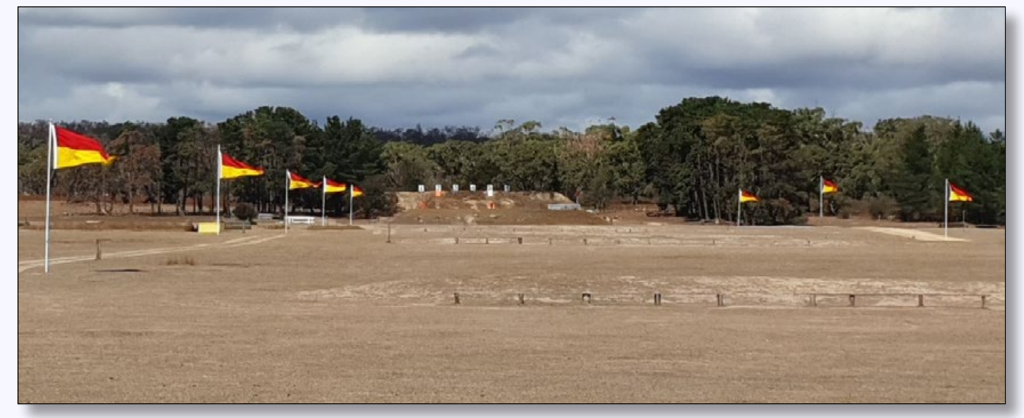
Not enough rain but plenty of wind