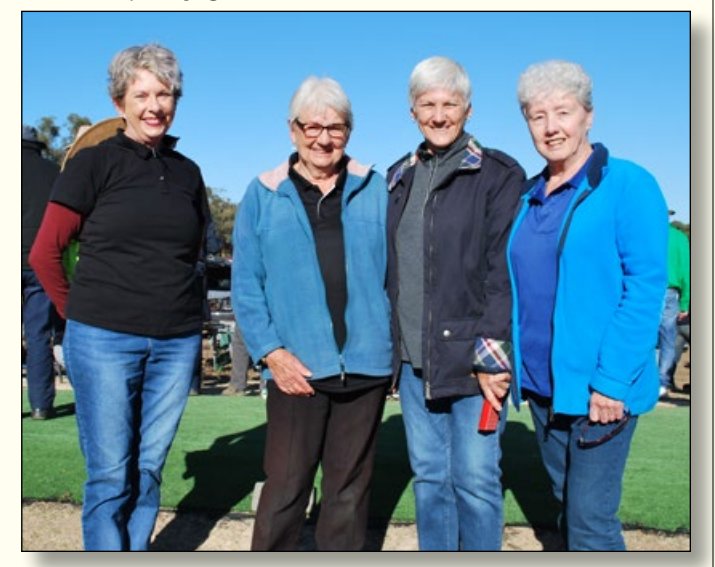
The Ladies on Queens Day 1