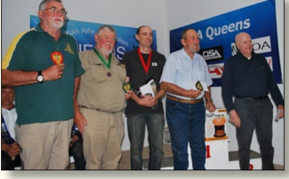
F Class Standard B Grade