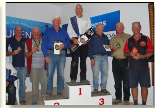
F Class Standard A Grade