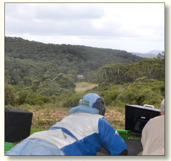
Looking down range

Thanks are expressed to the Horsley Park Gun Shop for their generous support of this meeting.