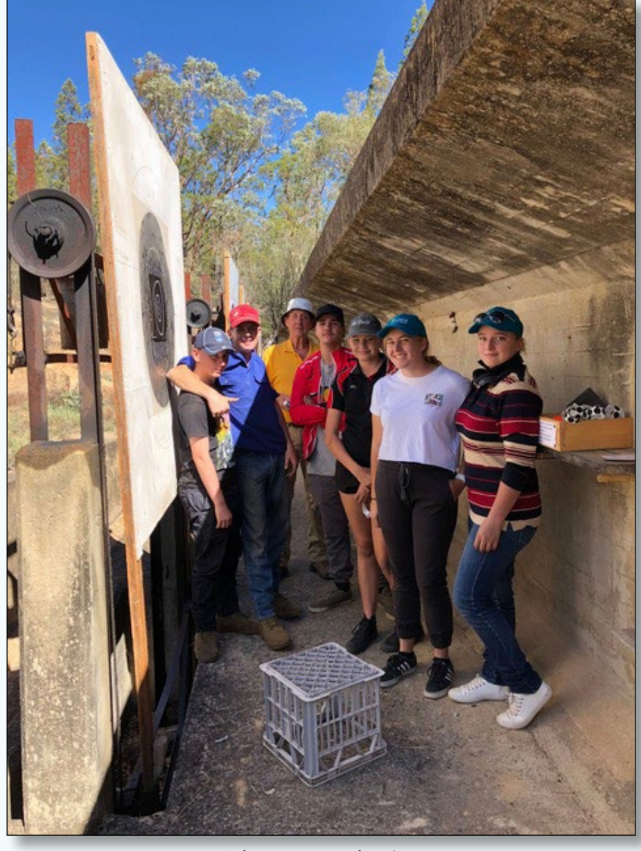
A fantastic group of markers