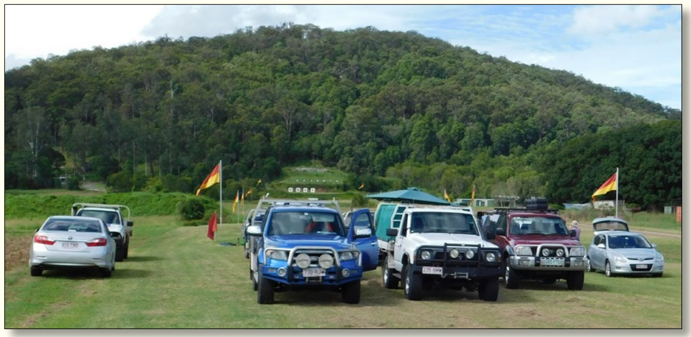
Range view at 500 yards