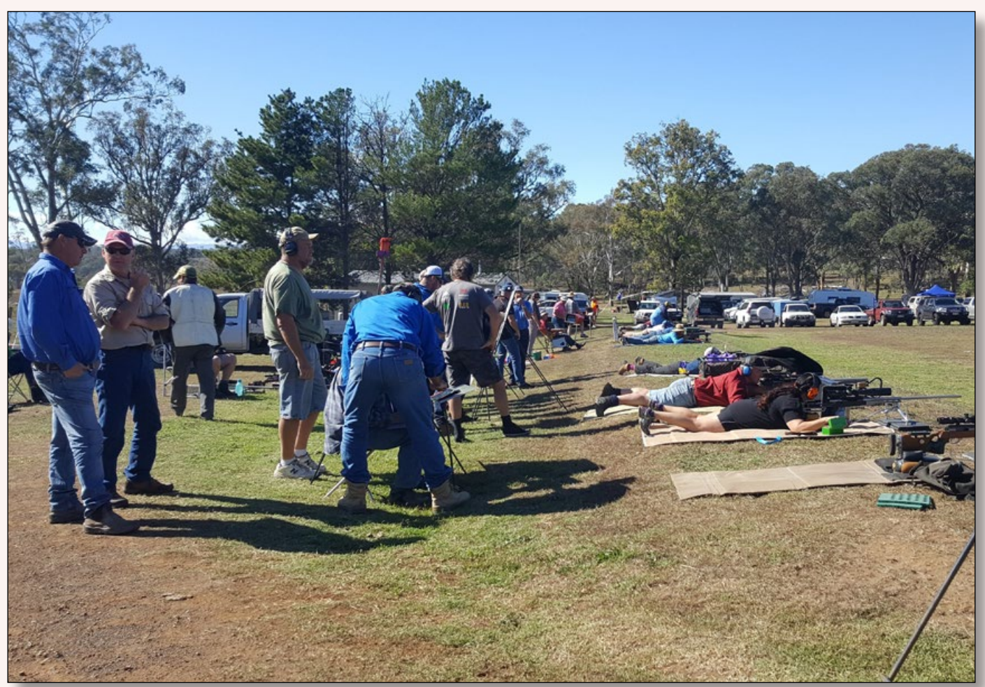
Shooters travelled from all over to compete