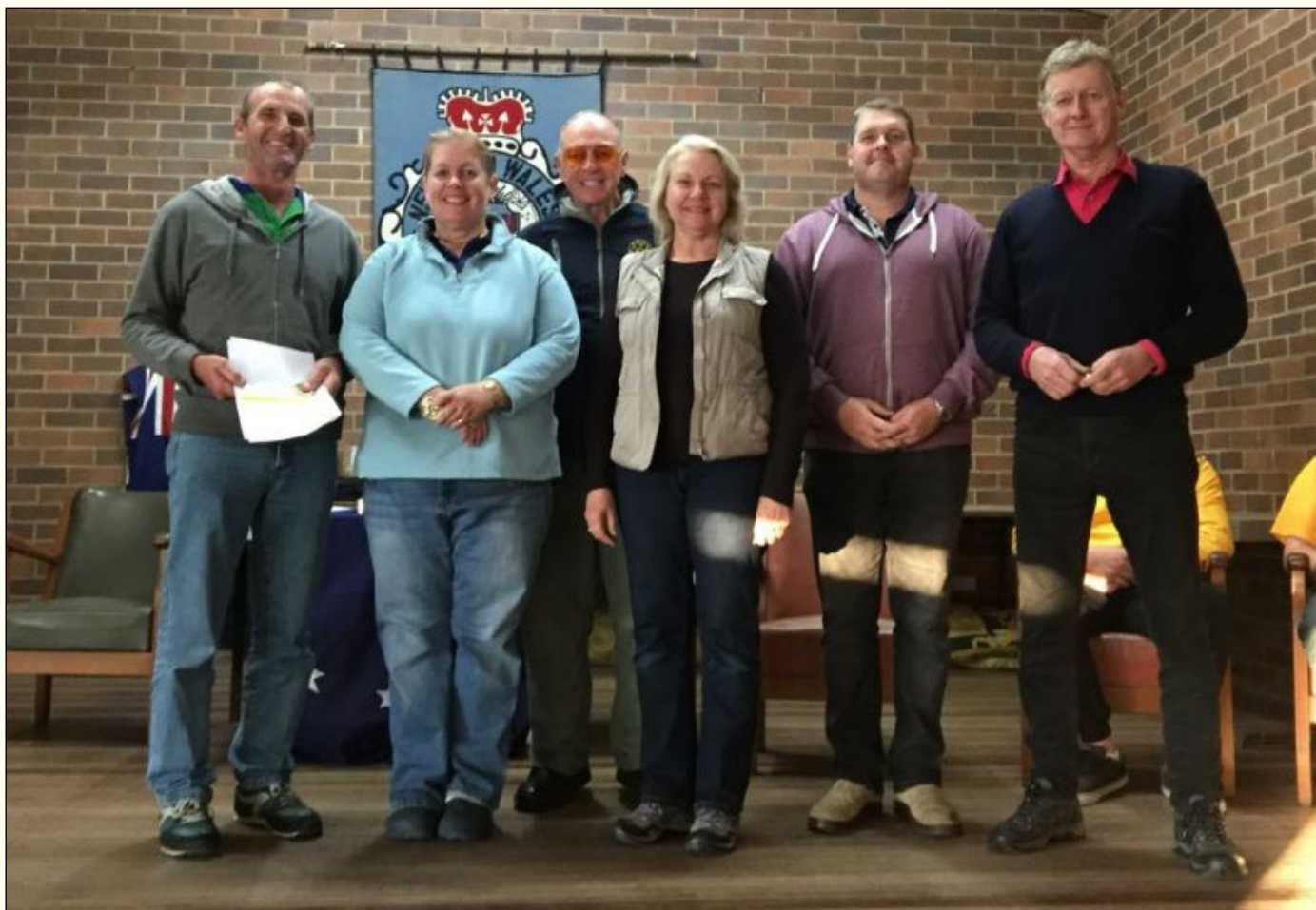
City FTR team – winners City v Country 2019