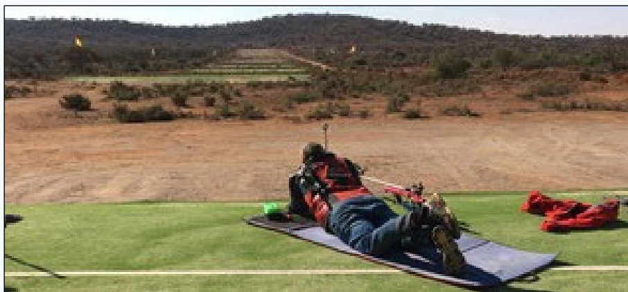
From the 900yds, a shooter getting ready to have a go at the last range of the day