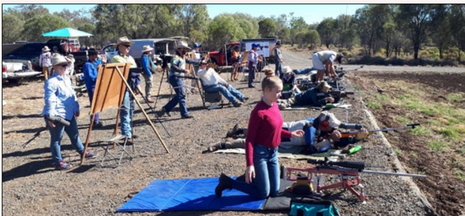
Shooters on the line