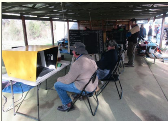
Shooting 600 yards under cover