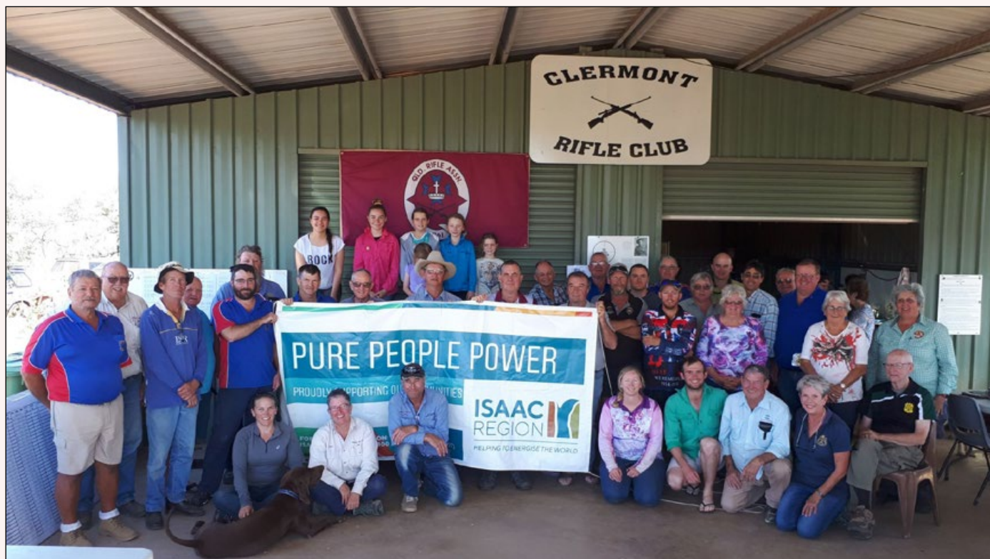
Clermont group photo