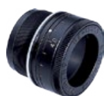
520 iris foresight