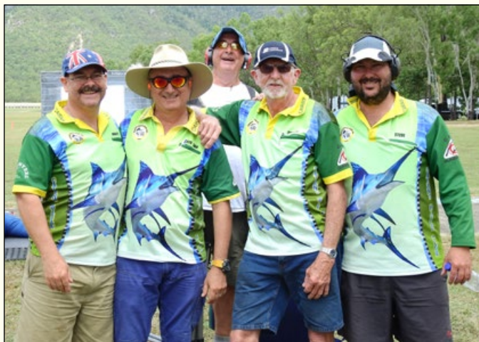
Cairns Rifle Club Larrakins

Thus, again for day two, sighting was sublime, and in fact it was commented by many competitors that it was in marked contrast to the heavy mirage of other years. The winds were light, and again this meant that competitors had to maintain a razor focus lest they drop a point due to a lapse in concentration.