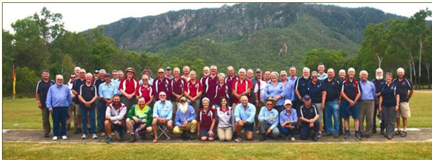
Happy attendees on the weekend of the National Veterans Teams Matches