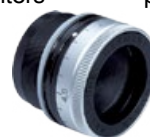
522-S iris foresight