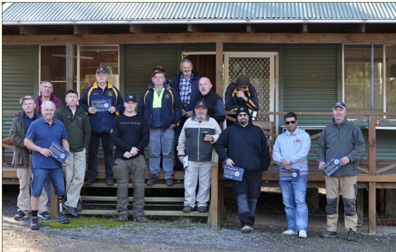
Group of competitors