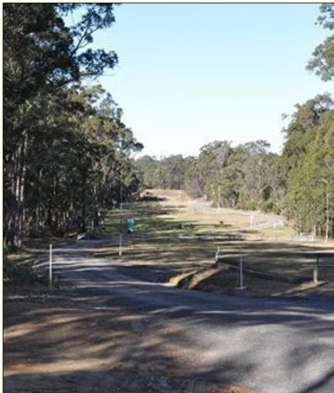
Looking down range from 700m

Proud supporter of ICFRA Long Range World Champs 2019 & Australian teams competing