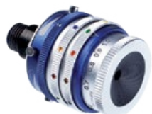
568MC rearsight iris, 48-colour and polarisation filter set