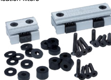
844 multi-height sight base set