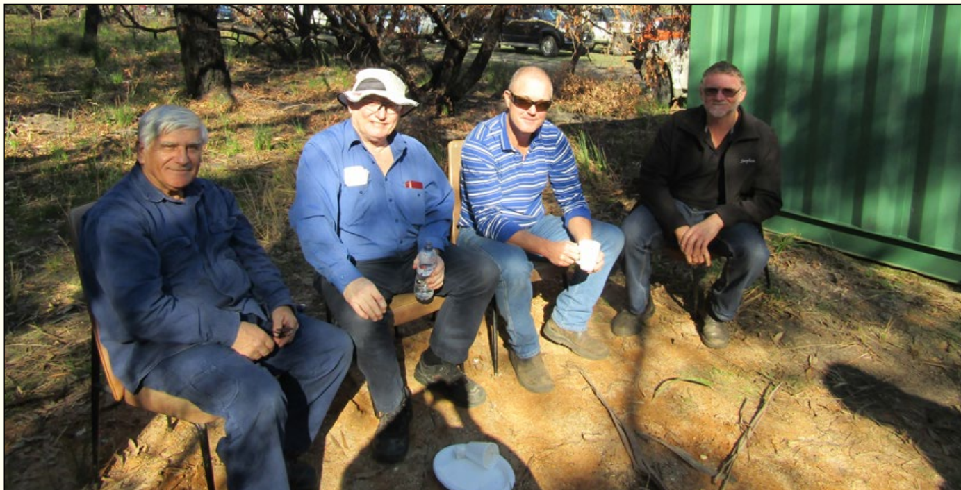
Competitors enjoying a well earned break