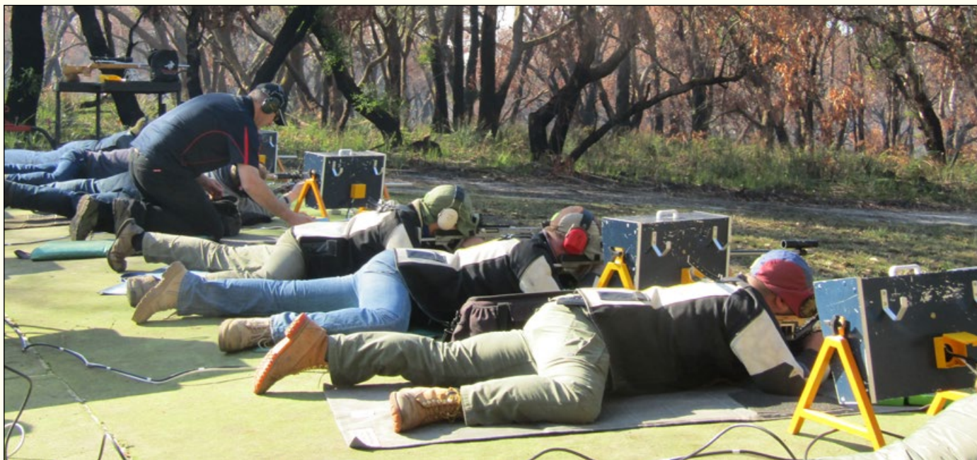
Competitors on the mound