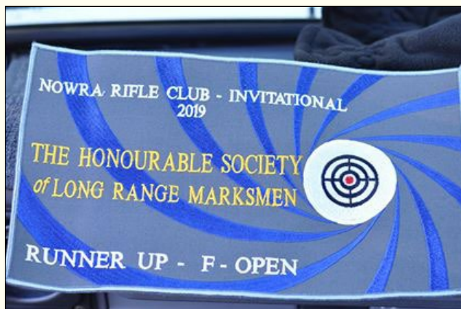
Invitational trophy badge

Unfortunately, we only had four to five weeks to promote the shoot and this reflected in the low participation rate. Next year, we will run the event again but with a lot of notice. Time slot yet to be programmed.