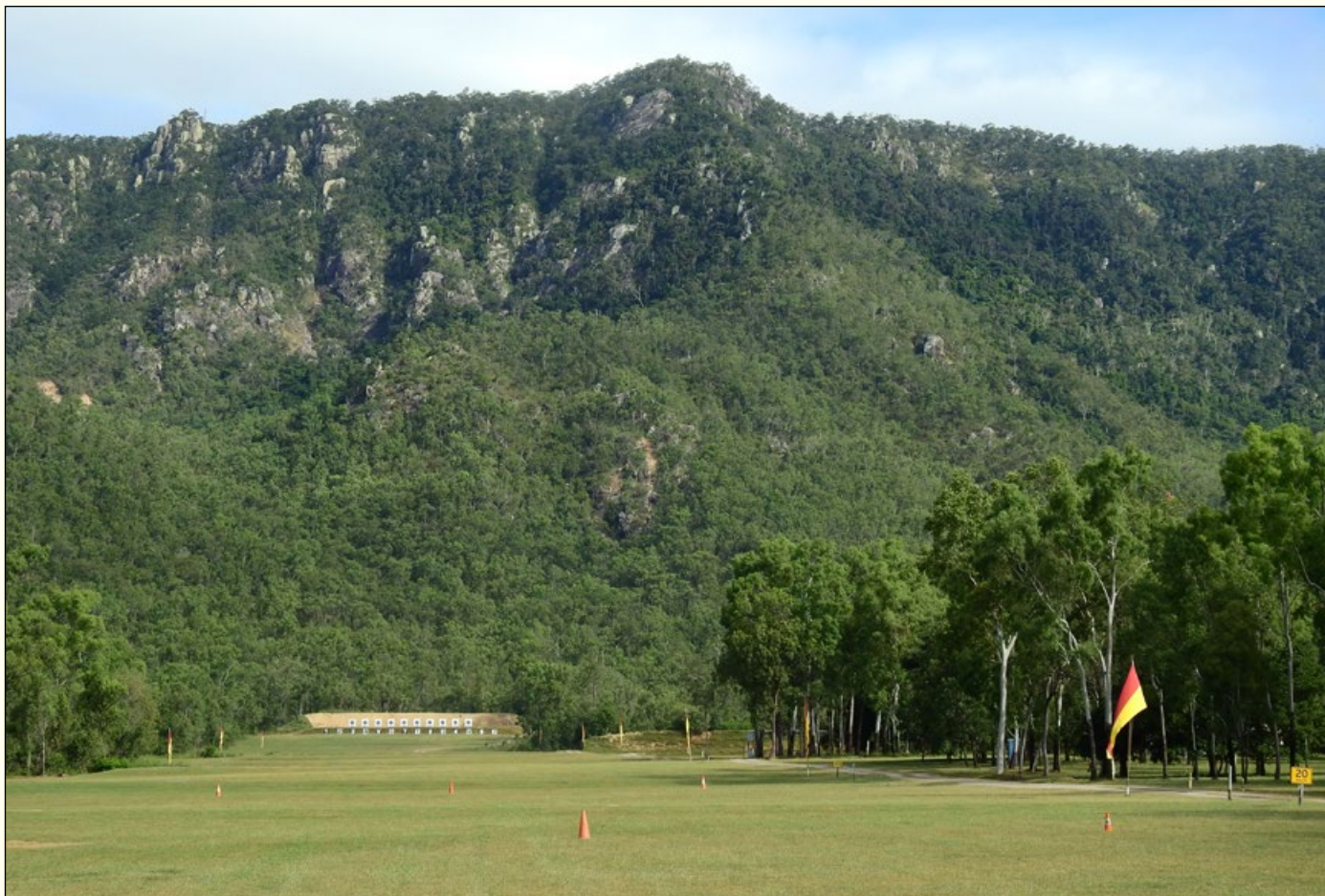
Harvey's Range Postcard Perfect