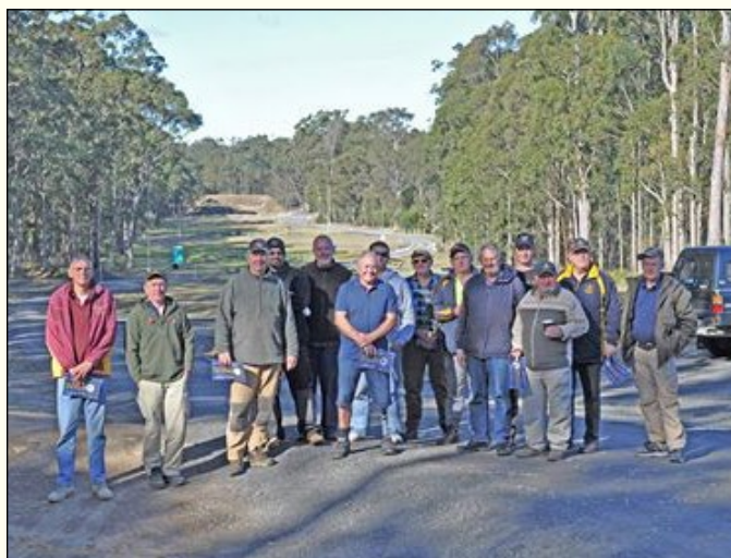
Motley group on the range