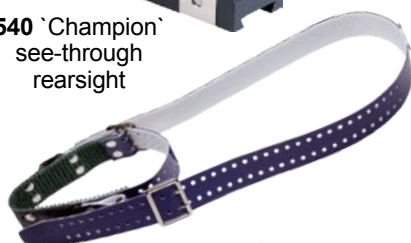
437 'pulse-free' sling