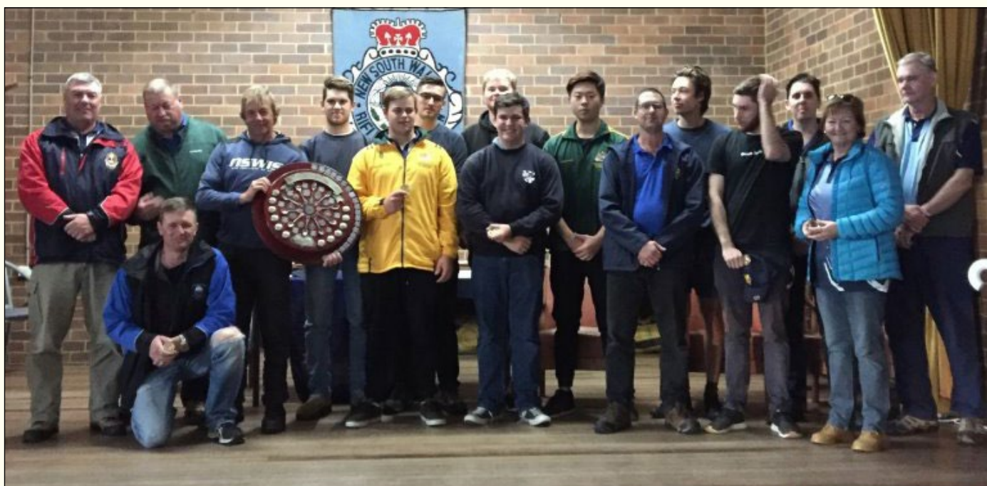
City TR team