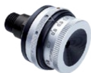
566-S rearsight iris, 6-colour filter