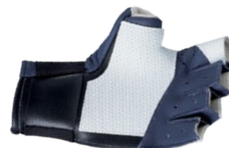
466 half-cover glove