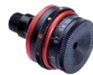
566-R rearsight iris, 6-colour filter