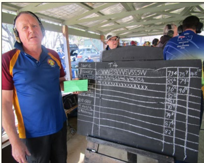
Scores on display