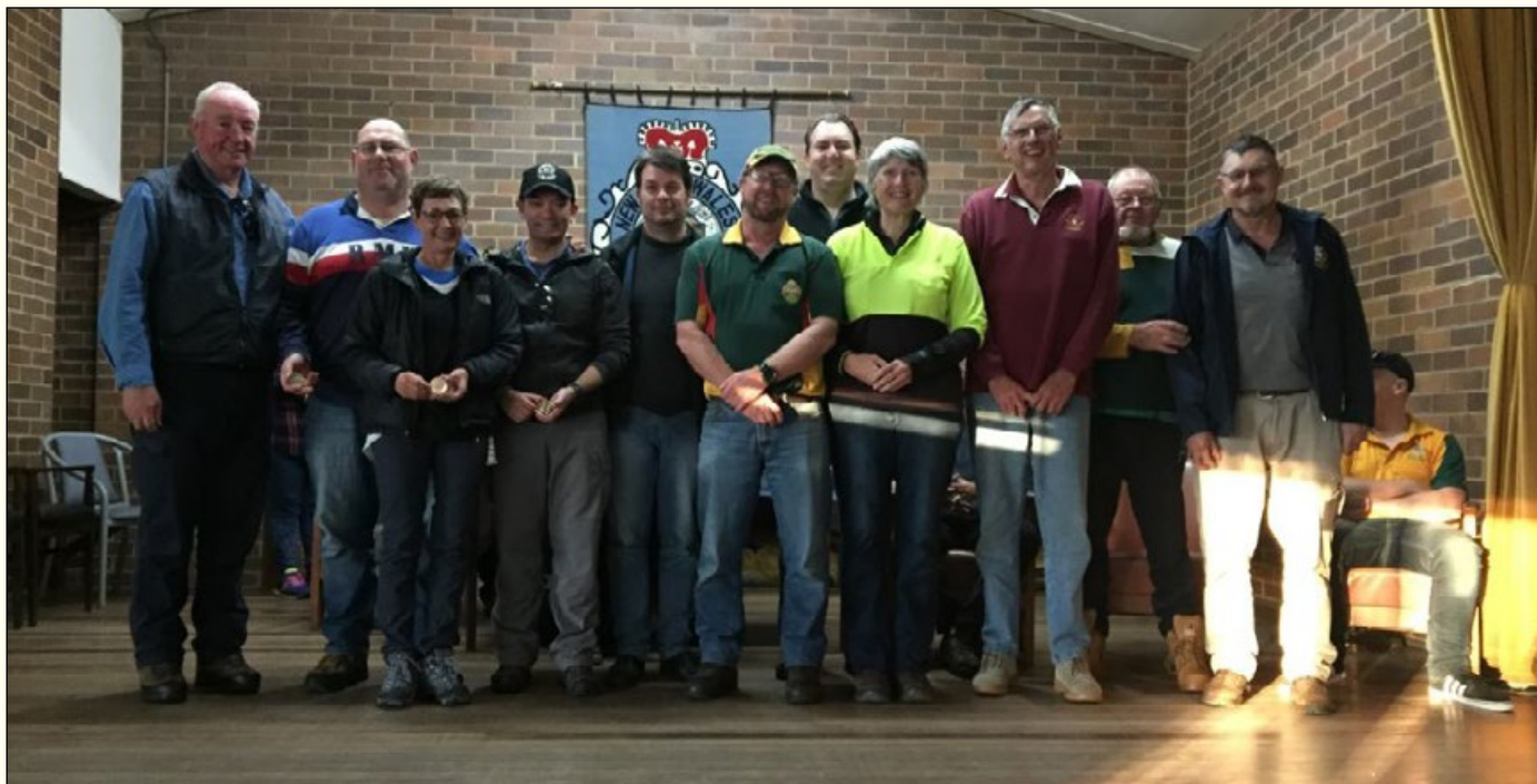
City F Standard team

brought in the heavyweight coaches to try and attempt what was in the past an impossible task.