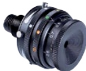
565 rearsight iris, 6-colour filter, two polarisation filters