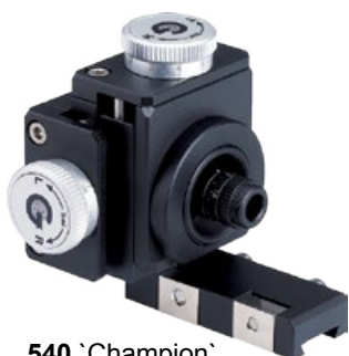
540 'Champion' see-through rearsight