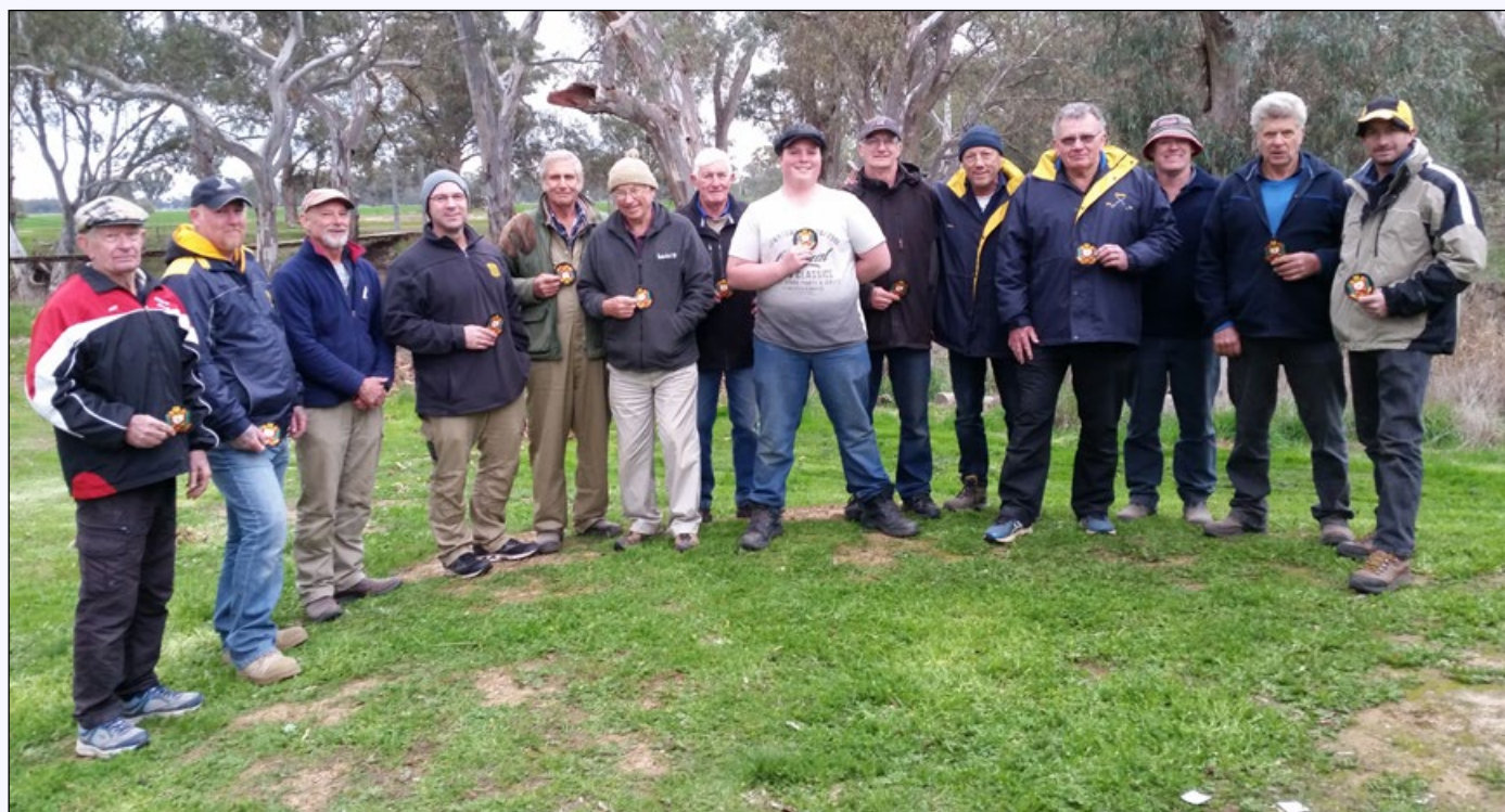
GVDRA Prize winners 2019