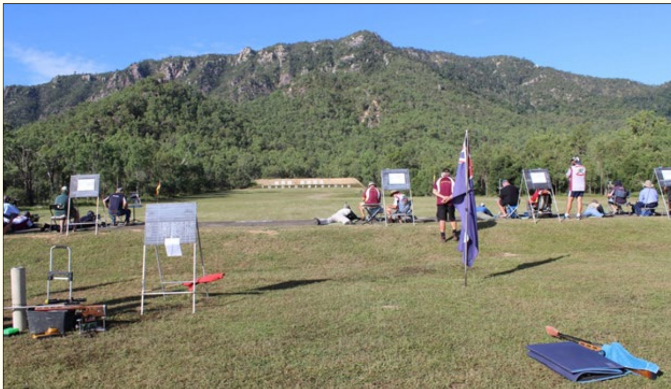
Gorgeous views on the shooting range