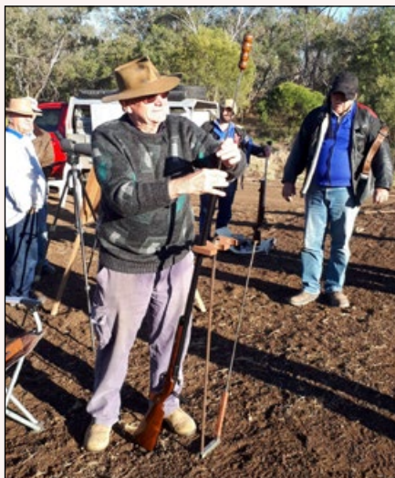
Des loads Black Powder rifle