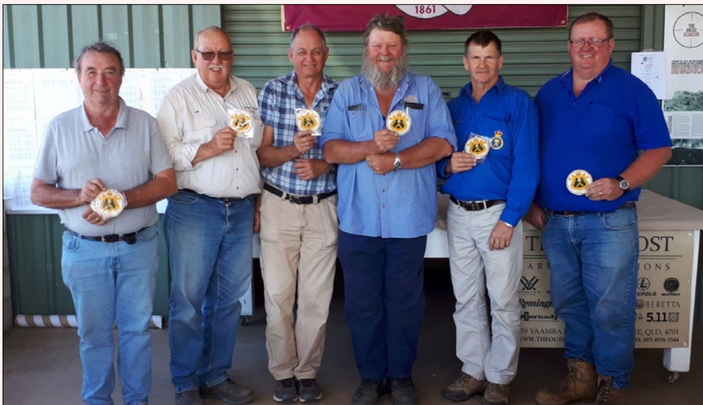
Grand Ag Winners