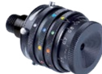
568 rearsight iris, 12-colour filter, two polarisation filters