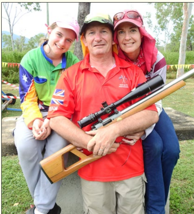
The Lawrence Clan

To put the ferocity of the competition in context, in the F Open competition, it was telling to see some of the shooters cut sixes to increase their X count. These are bold moves, but speak towards both the high level of the competition, coupled with the need to leverage maximum benefit from the available conditions. Sometimes this strategy paid off, sometimes not, and the fierce level of competition and the tactics created quite a talking point throughout the remainder of the Queens.